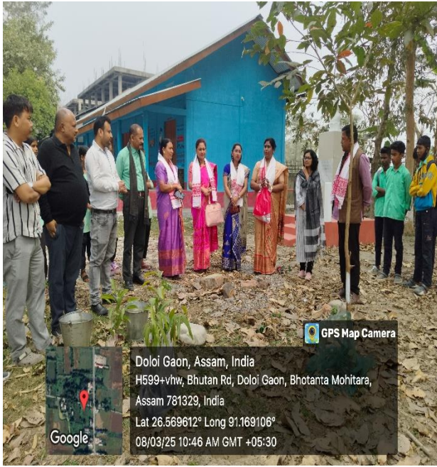
Doloi Gaon, Assam, India H599+vhw, Bhutan Rd, Doloi Gaon, Bhotanta Mohitara, Assam 781329, India Lat 26.569612° Long 91.169106° 08/03/25 10:46 AM GMT +05:30