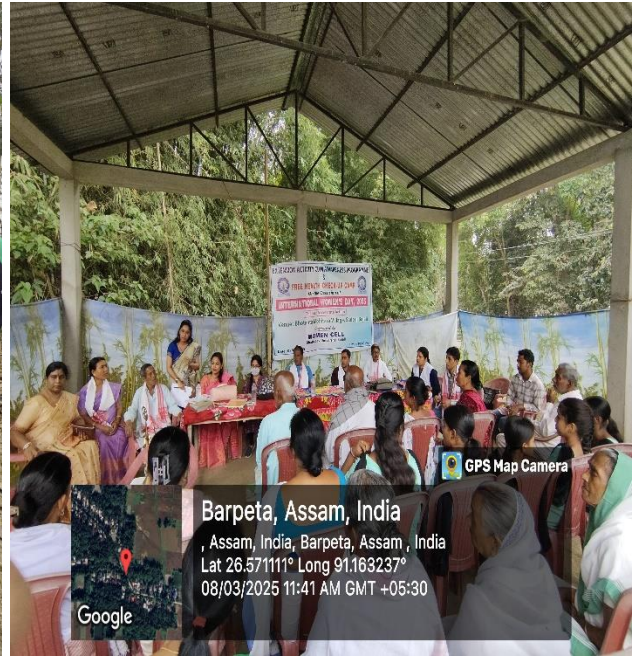
Barpeta, Assam, India Assam, India, Barpeta, Assam, India Lat 26.571111° Long 91.163237° 08/03/2025 11:41 AM GMT +05:30