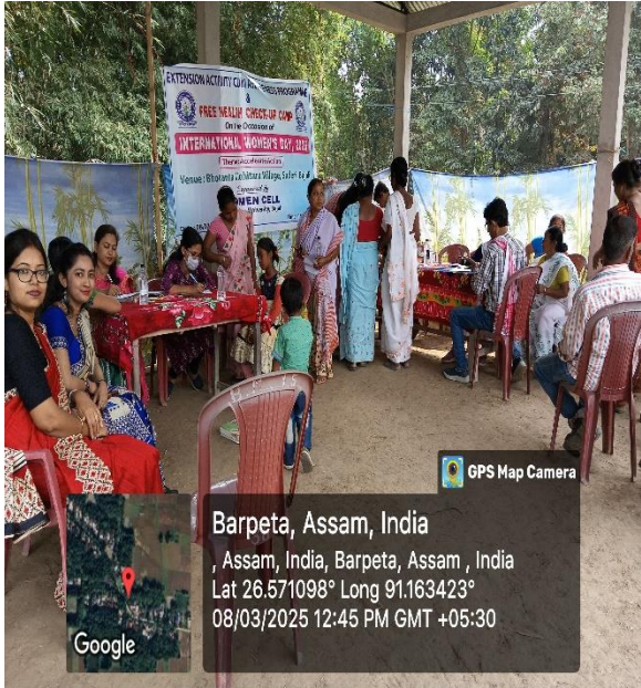
Barpeta, Assam, India Assam, India, Barpeta, Assam, India Lat 26.571098° Long 91.163423° 08/03/2025 12:45 PM GMT +05:30