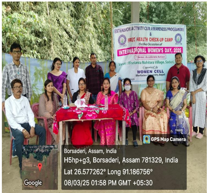
Borsaderi, Assam, India H5hp+g3, Borsaderi, Assam 781329, India Lat 26.577262° Long 91.186756° 08/03/25 01:58 PM GMT +05:30