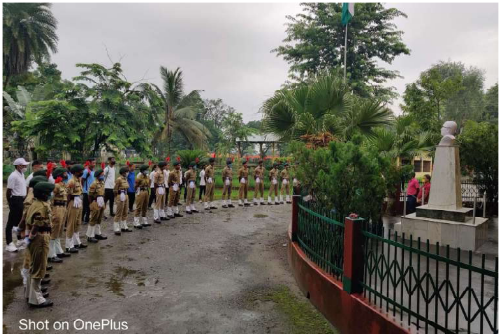
Shot on OnePlus