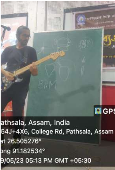
Pathalsala, Assam, India 54J+4X6, College Rd, Pathalsala, Assam at 26.505276° ong 91.182534° 9/05/23 05:13 PM GMT +05:30